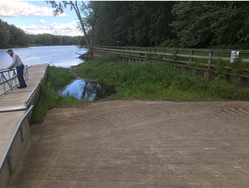
Figure 4. Severe siltation issues on the Colchester Point Fishing Access Area ramp on the Winooski River in Colchester Point.