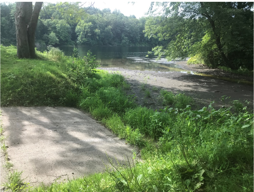
Figure 2. A new ramp (top image) was constructed this past summer at the Dummerston Access Area on the Connecticut River in Dummerston, VT. The old ramp (bottom image) was located in a small back water that had been completely filled with silt and was no longer usable.