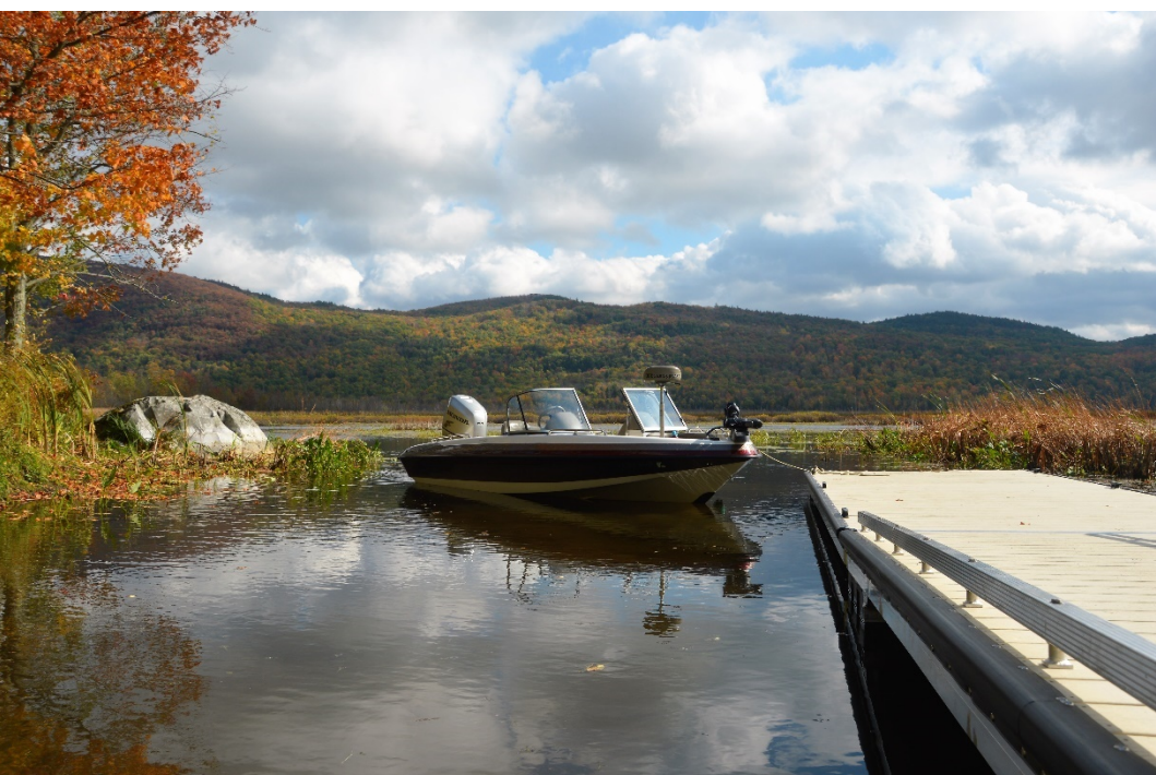
Figure 1. Newly installed low-profile docks at the Curtis Pond (top image) and Bristol Pond (lower image) Fishing Access Area in Calais and Bristol, VT. Low profile docks provide improved access for both motorboats and paddlecraft.