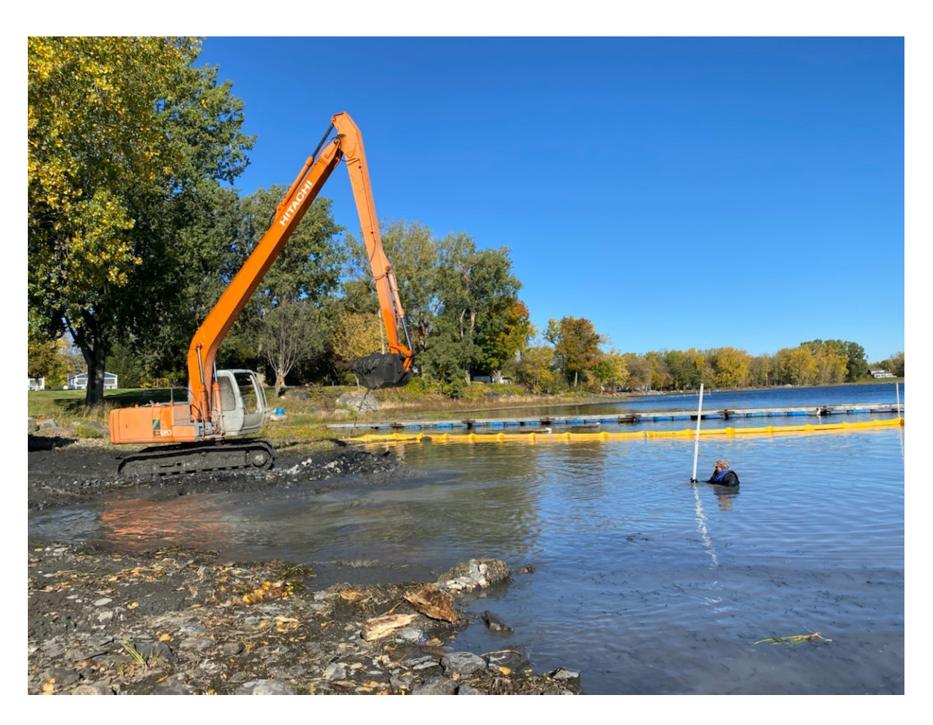
Kings Bay (Alburgh) – Three different ramps were dredged (Kings Bay, Larry Greene (Swanton), & Curtis Pond (Calais) to remove accumulated silt and make them more accessible to all boats. Prior to this work, these ramps were only usable during high water or by small boats during low water levels.